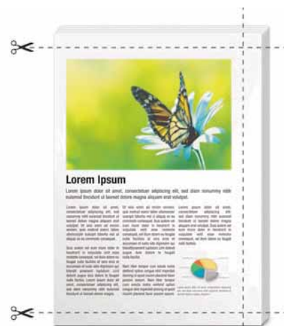
Three/one edge automatic trimming.